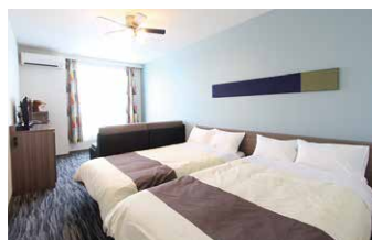
Standard twin (4 guests)

This guestroom is ideal for couples and families. The sofa bed, as comfortable as the beds, can be opened up for a third guest.