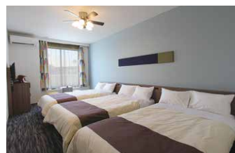
Standard triple (3 guests)

Up to four guests can stay in this guestroom. The ample space is perfect for families, groups, and girls-only getaways, etc.