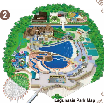
Lagunasias Park Map

Enter the Park from the exclusive gate for hotel guests! The Huis Ten Bosch Revue is right in front of the hotel, and is just a 1-minute walk to the Flower Lagoon where you can enjoy the colors of seasonal flowers.