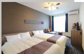
Standard twin (2 - 3 guests)

The bath and toilet are separate, so you can relax even with young children. The 120cm wide semi-double beds are equipped with the latest mattress (BREATHAIR®), and promises quality sleep. A variety of guestrooms are available for families, groups, and couples.