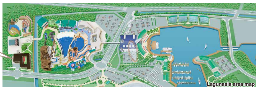
Lagunasia area map