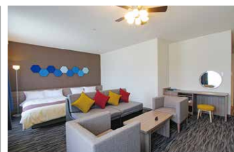
Deluxe twin (2 - 4 guests)

This guestroom has three semi-double beds, and is perfect for girls-only getaways, and couples, etc.